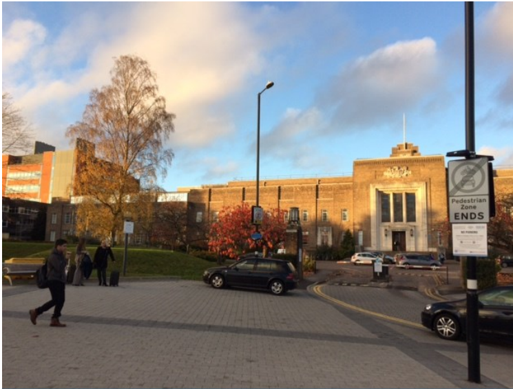
Birmingham Medical School