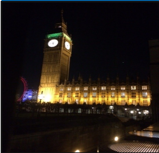
Houses of Parliament

On the 22nd November, Birmingham and Nottingham Universities hosted a reception at the Houses of Parliament, in conjunction with the East and West Midlands All Party Parliamentary Group to celebrate five years of partnership between the leading institutions in the West and East Midlands. What makes the Birmingham-Nottingham partnership distinctive is the depth of commitment and scope for staff to work together. This includes education, learning, teaching, and professional services, as well as a sustained approach to research collaborations. The partnership is unique in scale and depth and we have built trust and momentum, leading to a £10m investment over